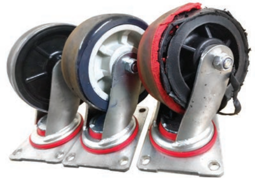
Pictured (left to right): Fallshaw, QHDC and EHI castors.

Unlike imported brands, which often rely on a weaker mechanical lock with a polypropylene centre (which is about half the strength of nylon), Fallshaw's method provides a significantly stronger and longer-lasting bond.